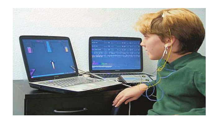
Fig. 1 Sample of neurofeedback set-up

As a child learns to control and improve brainwave patterns, the game scores increase and progress occurs. The only way to succeed at the games is for children to improve their brainwave function (following an operant conditioning paradigm). In research and clinical treatment